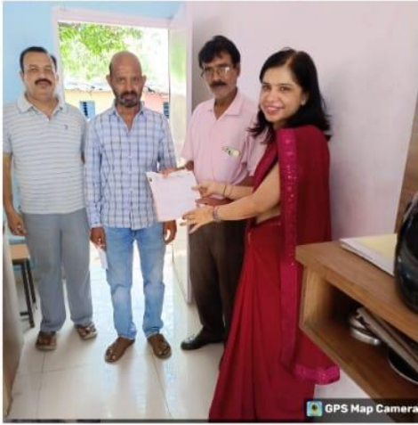
GPS Map Camera