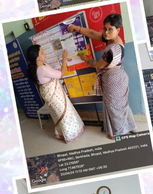
Bhopal, Madhya Pradesh, India 6F99+R6C, Berkheda, Bhopal, Madhya Pradesh 462021, India Lat 23.21956° Long 77.467828° 20/04/24 11:13 AM GMT +05:30