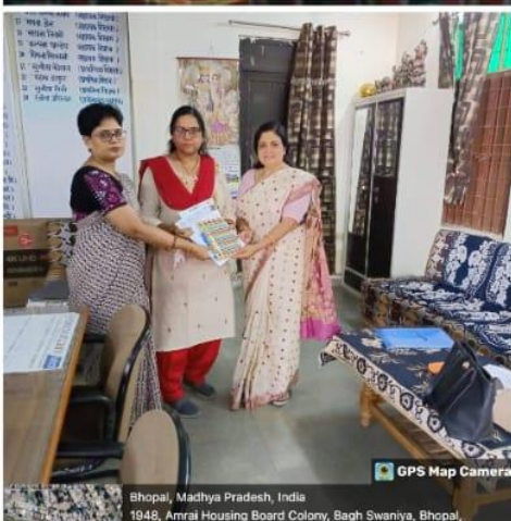
GPS Map Camera