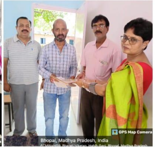
GPS Map Camera