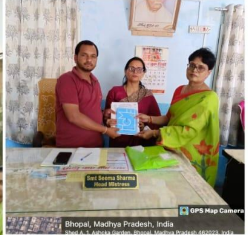
GPS Map Camera