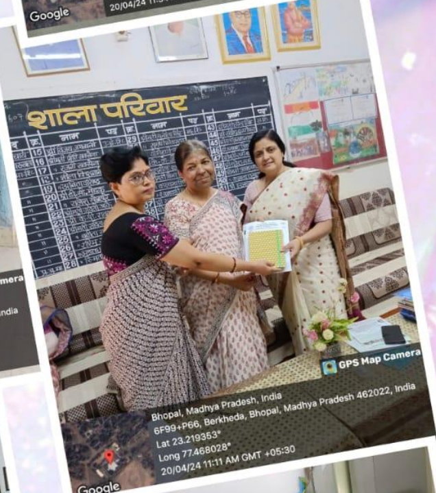
Bhopal, Madhya Pradesh, India 6F99+P66, Berkheda, Bhopal, Madhya Pradesh 462022, India Lat 23.219353° Long 77.468028° 20/04/24 11:11 AM GMT +05:30