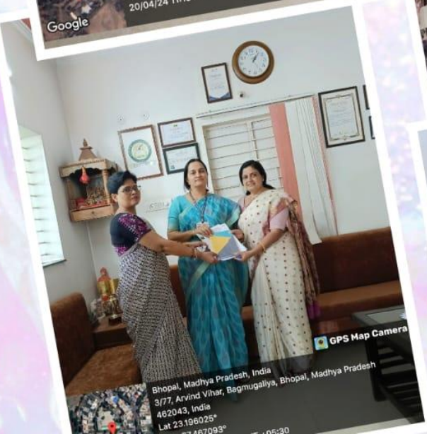
Bhopal, Madhya Pradesh, India 3/77, Arvind Vihar, Bagmugaliya, Bhopal, Madhya Pradesh 482043, India Lat 23.196025° Long 77.467093° 20/04/24 11:11 AM GMT +05:30