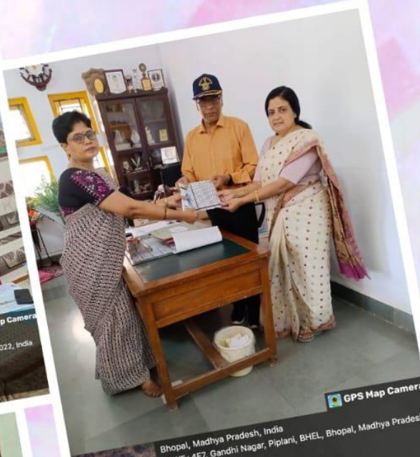
Bhopal, Madhya Pradesh, India 6FWF+4F7, Gandhi Nagar, Piplani, BHEL, Bhopal, Madhya Pradesh 462022, India Lat 23.245296° Long 77.473558° 20/04/24 11:34 AM GMT +05:30