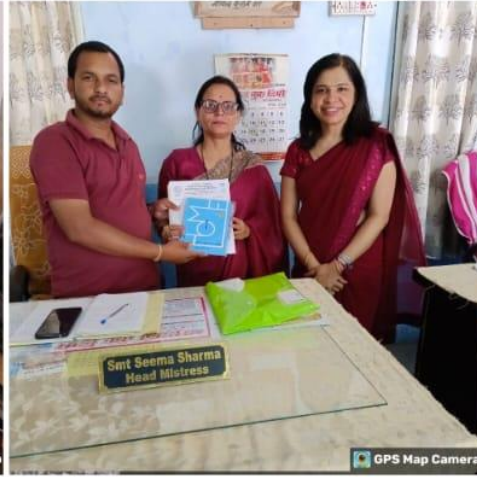
GPS Map Camera