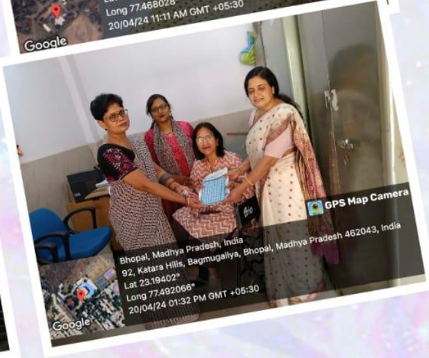
Bhopal, Madhya Pradesh, India 92, Katara Hills, Bagmugaliya, Bhopal, Madhya Pradesh 462043, India Lat 23.19402° Long 77.492066° 20/04/24 01:32 PM GMT +05:30