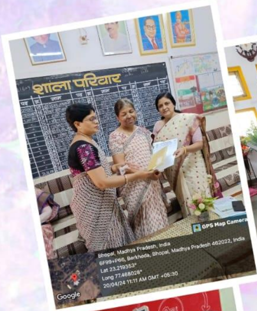
Bhopal, Madhya Pradesh, India 6F99+P66, Berkheda, Bhopal, Madhya Pradesh 462022, India Lat 23.219353° Long 77.468028° 20/04/24 11:11 AM GMT +05:30